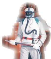
HOODS AND SAFETY HELMETS